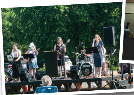
First Outdoor Service