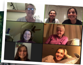
Tuesday Night Ladies' Grace Group