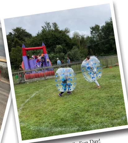
Fall Family Fun Day!