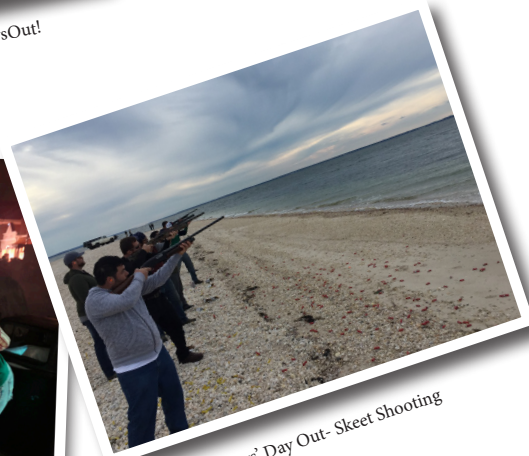
Guys' Day Out- Skeet Shooting