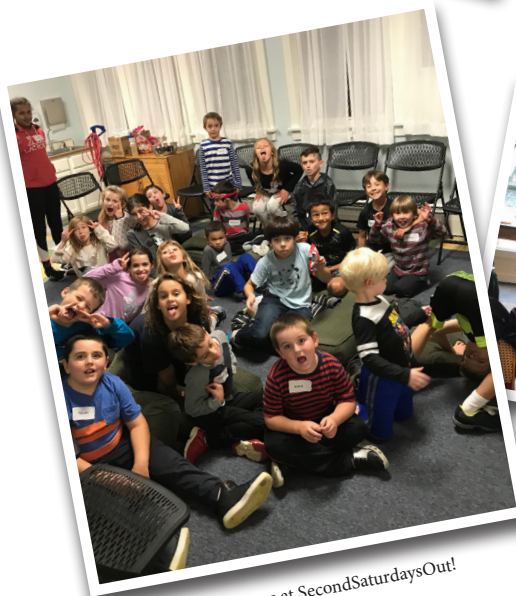
Silly faces at Second Saturdays Out!