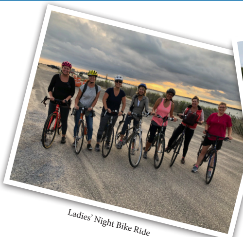
Ladies' Night Bike Ride

So maybe we have something to learn from our Filipino brothers and sisters: savoring the birth of our Savior should fill more of our days.