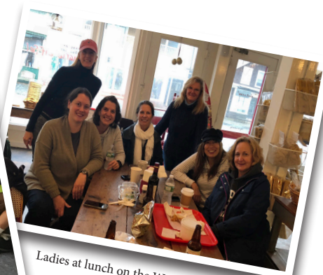
Ladies at lunch on the Women's Retreat!