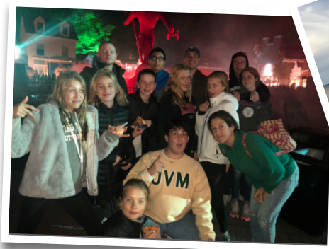
Youth Group at Six Flags